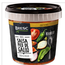
Pico de gallo 1000g