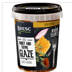
Honey and thyme glaze 450g