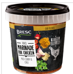
Marinade for chicken 1000g