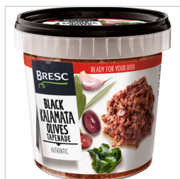
Black Kalamata olives tapenade 1000g