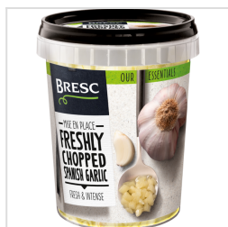
Freshly chopped Spanish garlic 450g