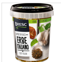
Bresc Erbe Italiano 450g