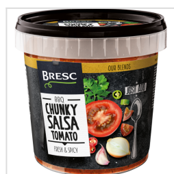
Bresc Chunky salsa tomato 1000g