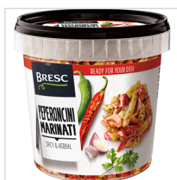
Bresc Peperoncini marinati 1000g