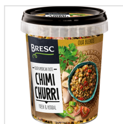
Bresc Chimichurri herb mix 450g