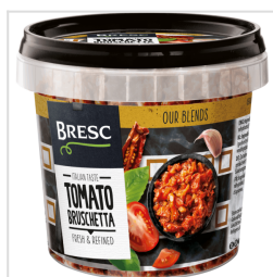
Bresc Tomato bruschetta 325g