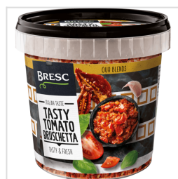
Bresc Tomato bruschetta 1000g