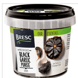
Bresc Black garlic puree 325g