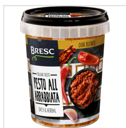
Bresc Pesto all'Arrabbiata 450g