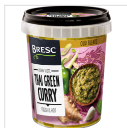
Bresc Thai green curry 450g