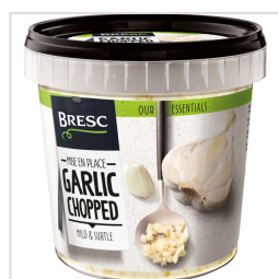
Bresc Garlic chopped 1000g