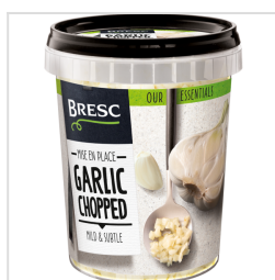
Bresc Garlic chopped 450g