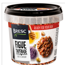
Bresc Tapenade figs 325g