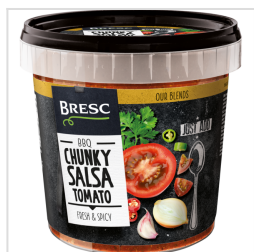
Bresc Chunky salsa tomato 1000g