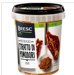
Bresc Strattu di pomodoro 450g