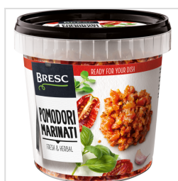
Bresc Pomodori marinati 1000g