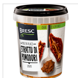
Bresc Strattu di pomodoro 450g