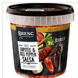
Bresc Chipotle and Bell Pepper Salsa 1000g