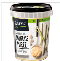
Bresc Lemongrass puree 450g