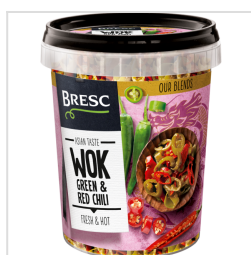
Bresc Green & red chilli WOK 450g