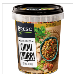
Bresc Chimichurri herb mix 450g